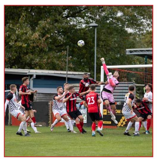
Another Erith Town corner is dealt with by the Deal Town keeper.