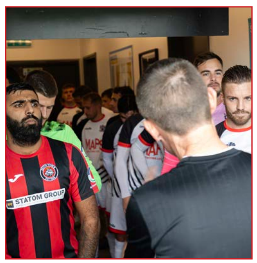
Both teams line up in the tunnel ready to take to the field.