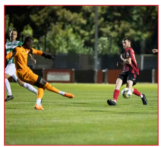
Erith Town made all the early running up against a dogged Corinthian.