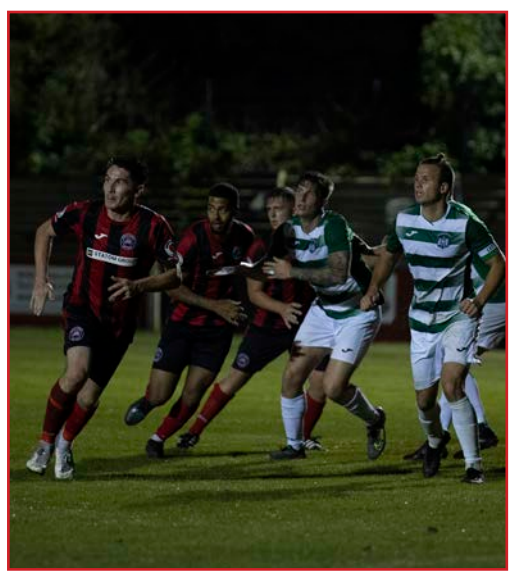
The Dockers pressure was relentless for the first half of the game and there was only one team in the contest.