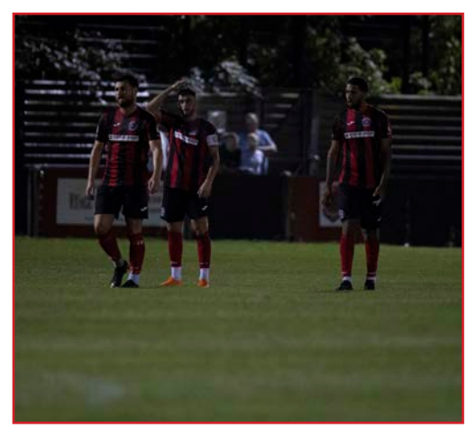
Giving up 3-0 lead proves an abject lesson in what happens when you switch off at any level.