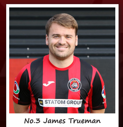
The Bed Post