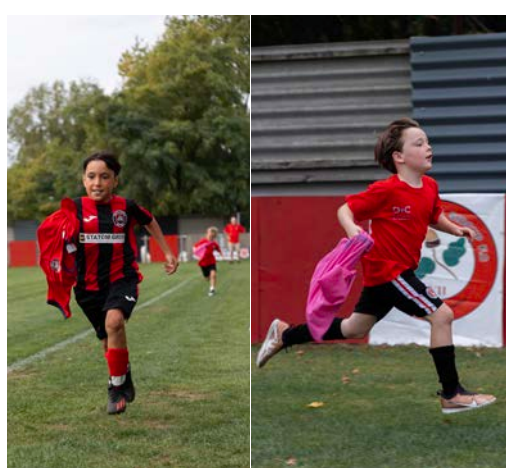
not have been able to do it without them!

From putting out corner flags and helping with the team sheets that are given to the referee to ensuring the team line-ups are displayed and goal scorers are declared over the match day tannoy, our young volunteers were absolutely superb and those behind the scenes at the Stanmore Stadium would