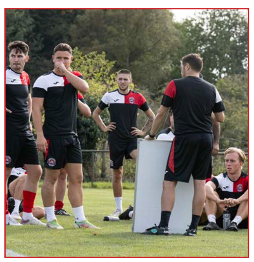
The team are typically focused as they go through some last minute tactics talks.