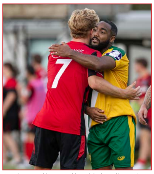
Good natured hugs and handshakes all round and a decent 2-0 away win for The Dockers.