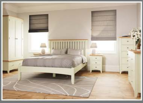
Visit us at Unit 2, Tower Retail Park, Crayford, DA1 4LB